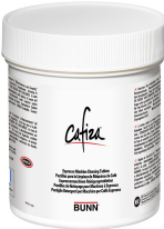
CLEANING TABLETS, CAFIZA 100T