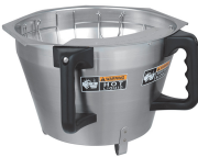
FUNNEL ASSY W/ BASKET, TITAN